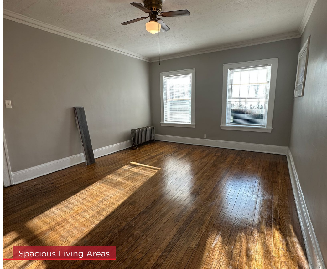
Spacious Living Areas