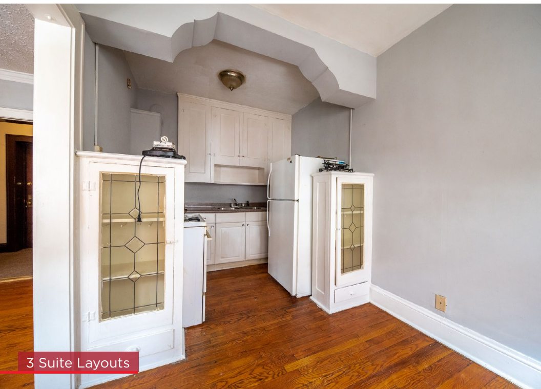
3 Suite Layouts