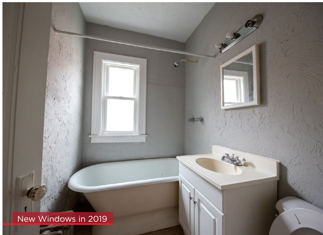
New Windows in 2019