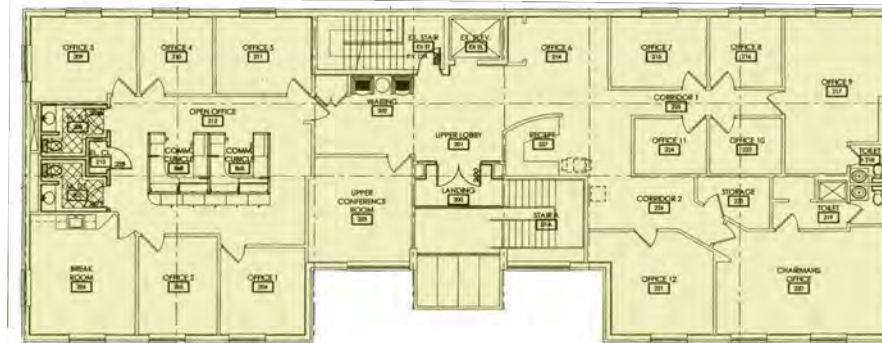
UP UNIT 6,300 SF