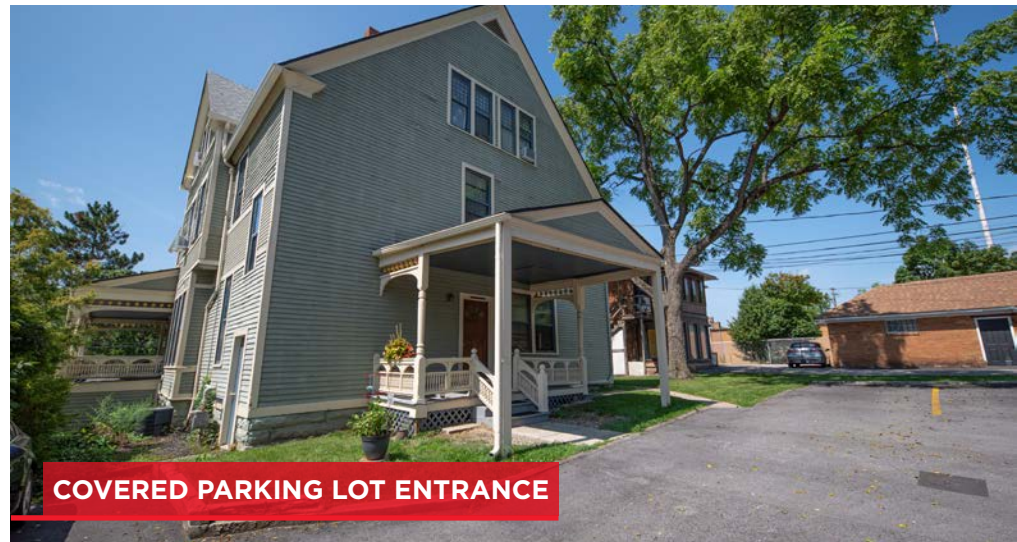
COVERED PARKING LOT ENTRANCE