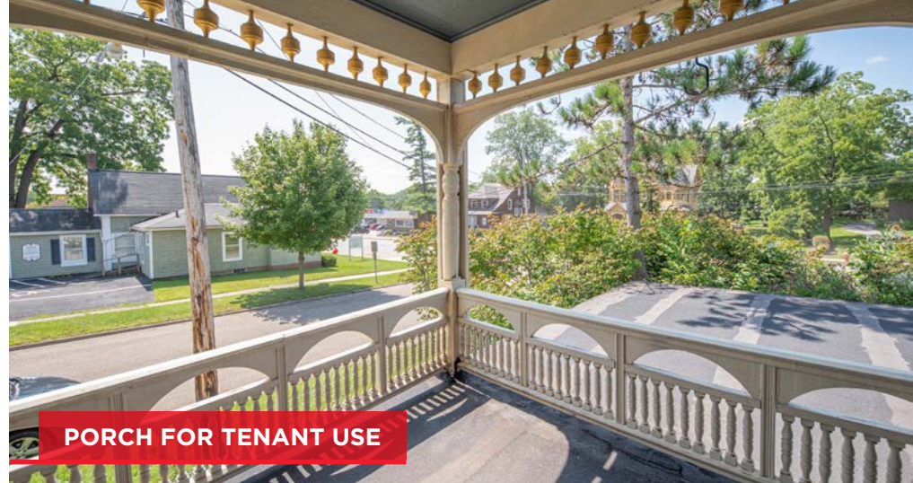
PORCH FOR TENANT USE