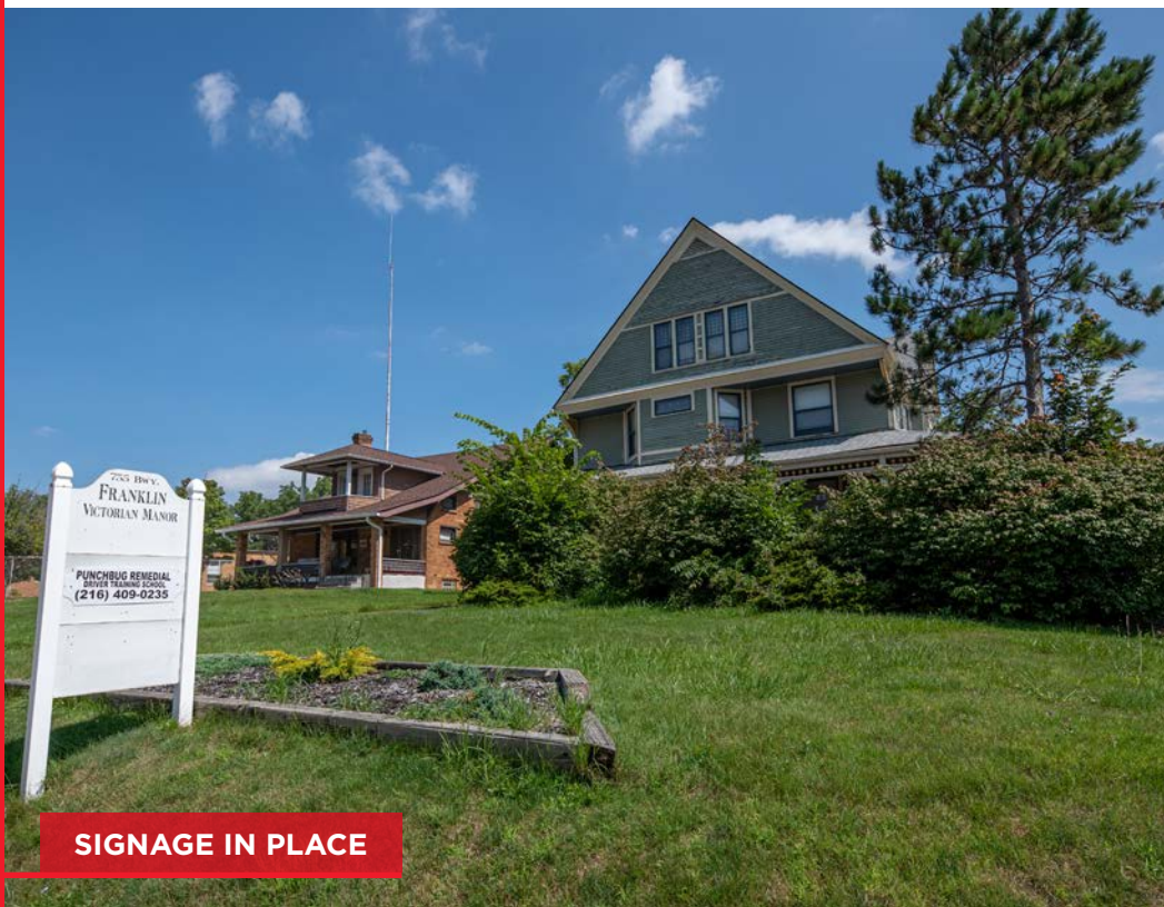
SIGNAGE IN PLACE