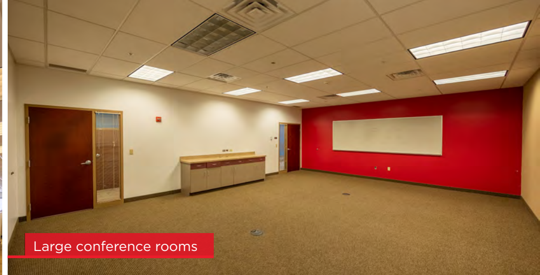
Large conference rooms