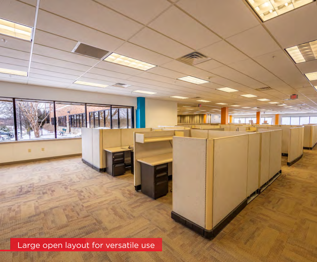
Large open layout for versatile use