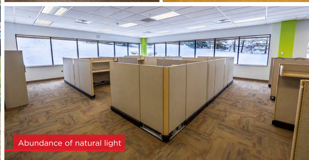
Abundance of natural light