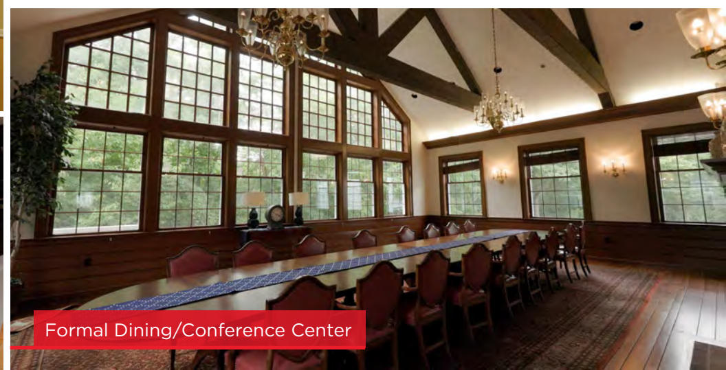
Formal Dining/Conference Center