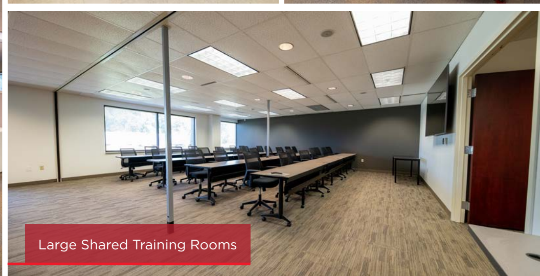
Large Shared Training Rooms