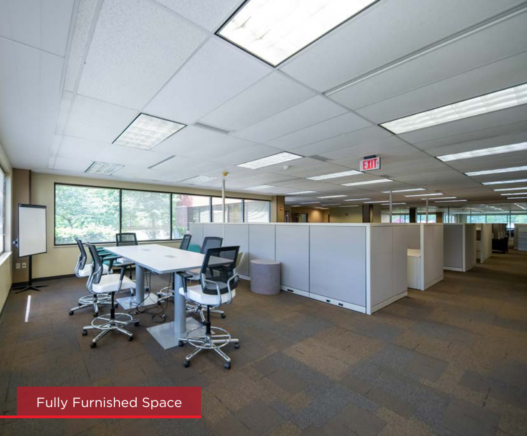
Fully Furnished Space