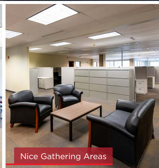
Nice Gathering Areas