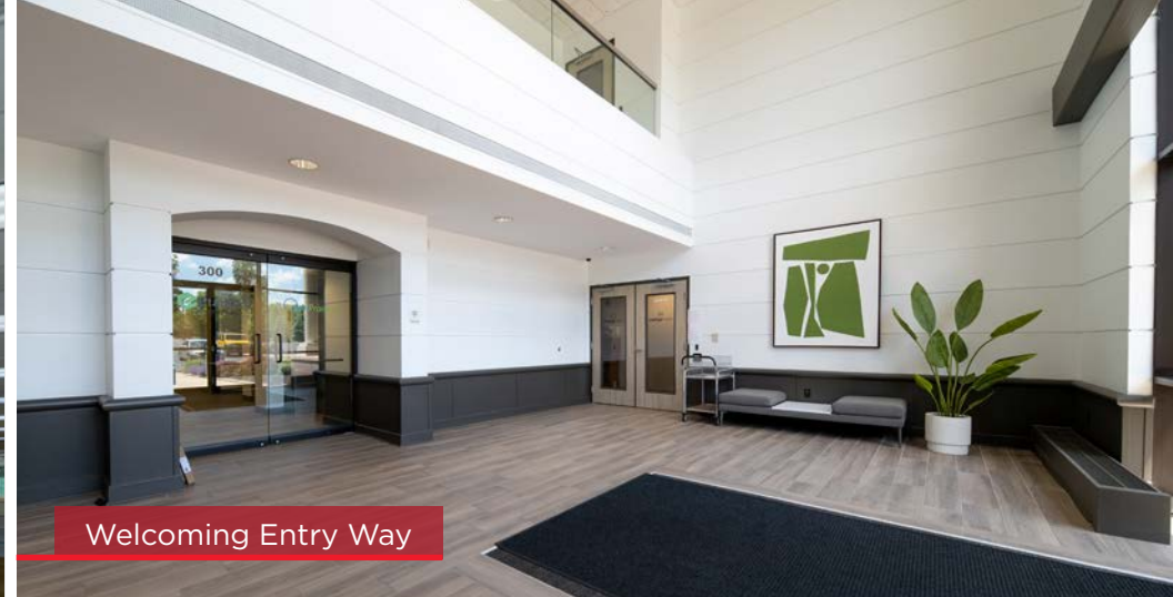
Welcoming Entry Way