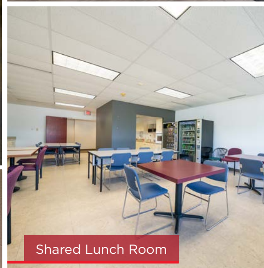
Shared Lunch Room